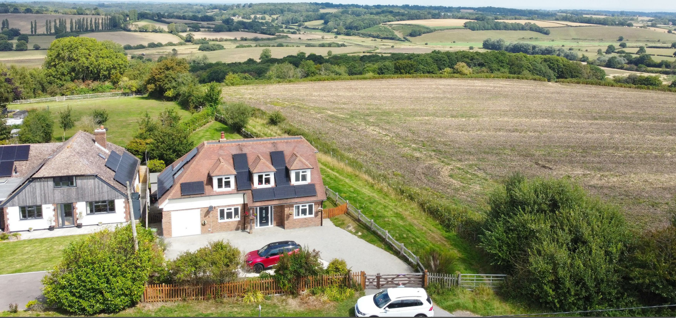
Lilac Cottage Udimore Road, Udimore, Rye, East Sussex TN31 6AY Guide Price £725,000